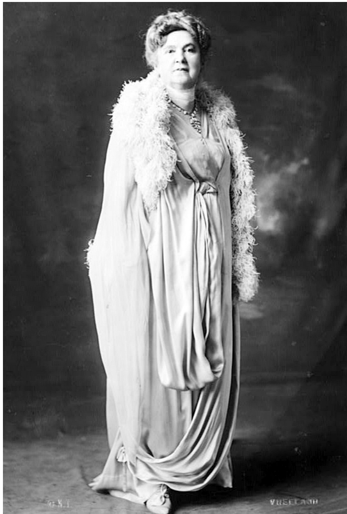
Following the death of Madame Blavatsky (left), the Theosophical Society splintered with Katherine Tingley (right) taking the reins of the U.S.-based lodges in 1896