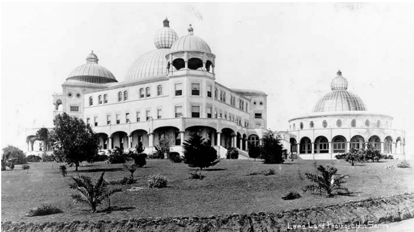
In 1900, Katherine Tingley founded the International Theosophical Headquarters, aka “Lomaland,” in Point Loma, a seaside community in San Diego, California

“The code is a set of self-regulations based on sound morals common to all peoples and all religions.”