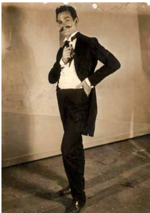
Emil Anton Bundsmann, raised in the dramas of Lomaland, pursued an acting career in New York and in summer stock. He changed his name to Anthony Mann in 1941 when he began to direct