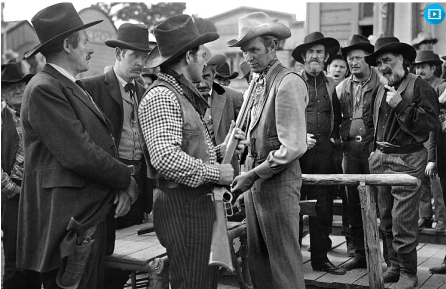
"In Winchester 73 he went out to destroy the man who killed his father... So he killed his brother. This is as powerful and strong a yarn as you can tell." Anthony Mann

his reasonable stewardship of the PCA, displaying a markedly more liberal reaction to the rapid cultural changes of the early 1960s. Adultery, narcotics, prostitution, and violence all found a way onto movie screens, but the last taboo against which Shurlock held fast was the depiction of gay relationships.