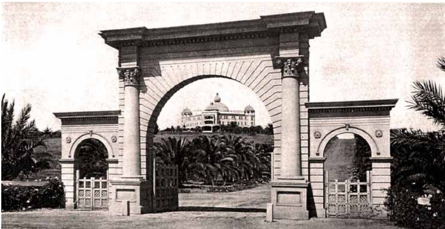
The onion-shaped glass domes atop Lomaland's major buildings were lit at night and could be seen for miles

So the physical has its weaknesses, its passions, its greed, its deceit, its imperfections; it is on this plane for the purpose of self-evolution; it is not evil, it is only undeveloped good. And so we have the soul the Inspirer, the protector; and the mind the vehicle, receiving the inspiration from this higher source as far as it is able to."