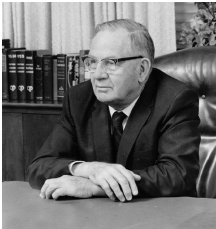
Anthony Mann (left), born in Lomaland, lived there until he was 15. Geoffrey Shurlock (right) arrived at Lomaland at age seven and left there at the age of 24